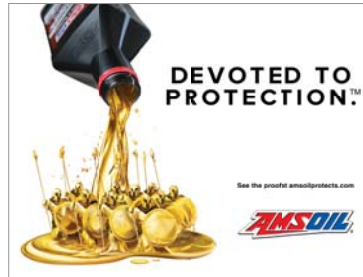
Window Decal 9"x12" (G3356)