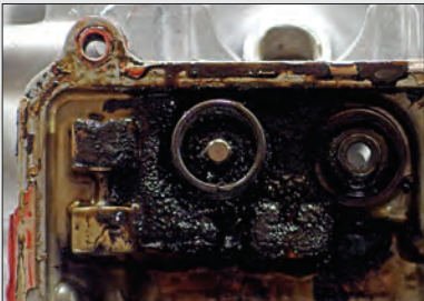
Leading Oil Brand 125 Hours

Degraded fuel results in varnish and insoluble debris, leading to rough idling and poor throttle response that frustrates your crew and kills productivity. AMSOIL Quickshot® is formulated to thoroughly clean varnish, gums and insoluble debris in two- and four-stroke gasoline-powered small engines.