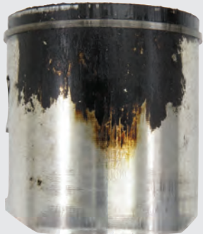
Leading Oil Brand 300 Hours

Formulated with low-volatility synthetic base oils, a heat-stable additive system and concentrated carbon cleaners, AMSOIL Synthetic Small Engine Oil resists oil breakdown and damaging deposits, providing outstanding protection and peak performance for the life of your equipment, maximizing productivity.