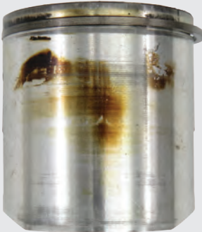
AMSOIL SABER Professional 300 Hours

Following 300 hours of professional-use testing in STIHL® string trimmers at the manufacturer mix ratio of 50:1, SABER Professional kept pistons and rings virtually free of carbon and wear (see the picture on the top), while use of a leading oil brand caused significant carbon buildup around the ring area (see the picture on the bottom). This engine is nearing the failure point.