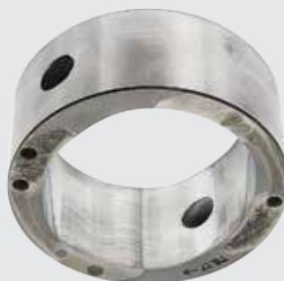
VANE PUMP CAM RING

Order by Phone 1-800-956-5695 - Give Operator Reference #5847896