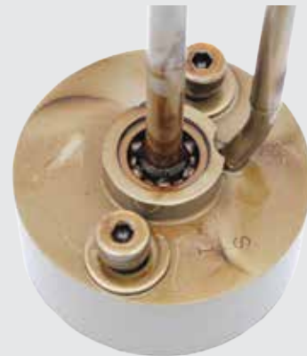
AMSOIL SYNTHETIC MULTI-VISCOSITY HYDRAULIC OIL (ISO 46)