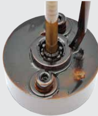
LEADING CONVENTIONAL HYDRAULIC FLUID (ISO 46)