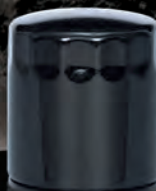
AMSOIL E 3 FILTERS