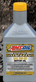
SYNTHETIC MOTOR OIL