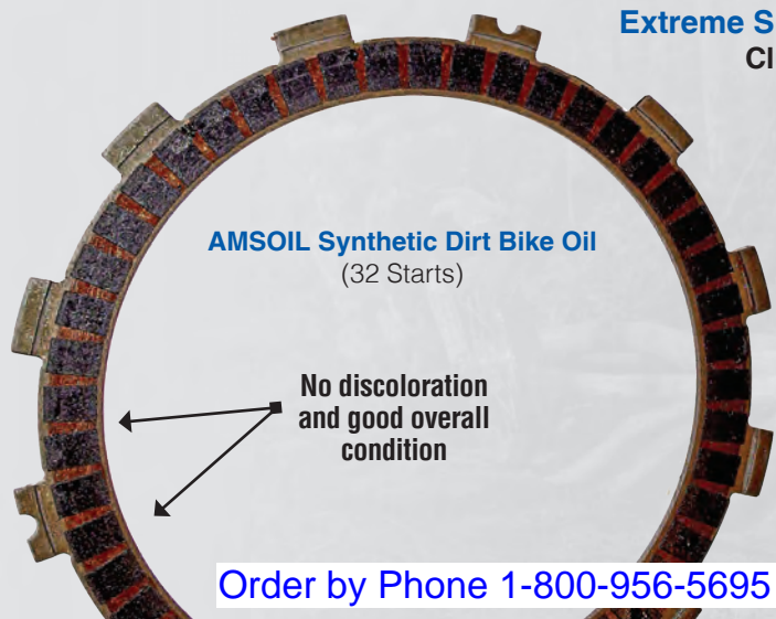
AMSOIL Synthetic Dirt Bike Oil (32 Starts)

No discoloration and good overall condition