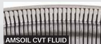
AMSOIL CVT FLUID