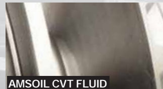
AMSOIL CVT FLUID

Order by Phone 1-800-956-5695 - Give Operator Reference #5847896