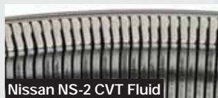
Nissan NS-2 CVT Fluid